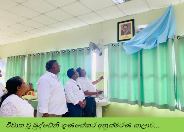
විවෘත වූ බුද්ධෙනි ගුණසේකර අනුස්මරණ ශාලාව...