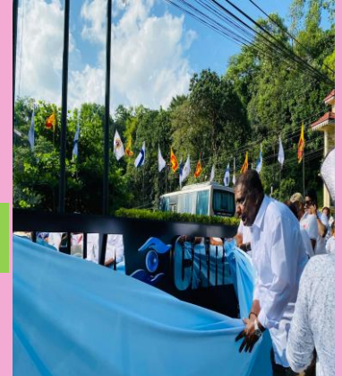
විවෘත වූ නෛසෙත නාමය....