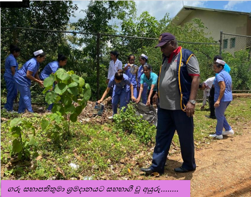
ගරු සහායනිකුමා ශ්‍රමදානයට සහභාගී වූ අයුරු.....

The main aim of the campaign was to promote a clean and healthy environment within the hospital premises and surrounding areas. All participants joined hands to clean, plant trees, and properly manage waste, emphasizing the importance of environmental hygiene for a healthier community. The event not only contributed to a cleaner environment but also strengthened unity and teamwork among staff members.