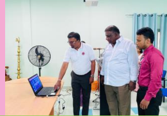
නෛසෙත පළමු සභරාව වෙබ් අඩවියට මුදා හැරුණු අවස්ථාව..