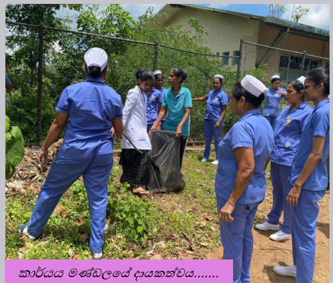
කාර්යය මණ්ඩලයේ දායකත්වය.....